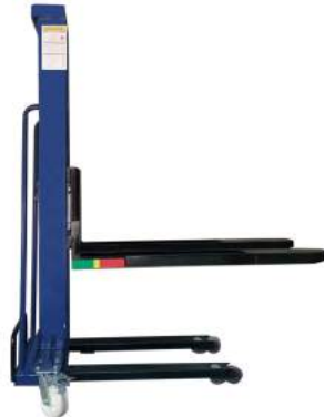
Reinforced forks Higher load capacity